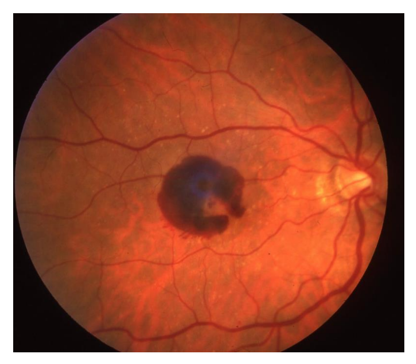
Figure 1: Retinal fundoscopy of wet AMD

A 70 years old female, complaining of poor vision and visual distortion in the right eye for the last two weeks, was found to have normal anterior segments of the same eye with a retinal fundus lesion as shown in Figure 1. The figure shows macular sub retinal hemorrhage with few scattered small drusens around the hemorrhage, no other macular or peripheral punched out chorioretinallesions. The patient denied any past history of trauma, laser therapy or having HTN or DM.