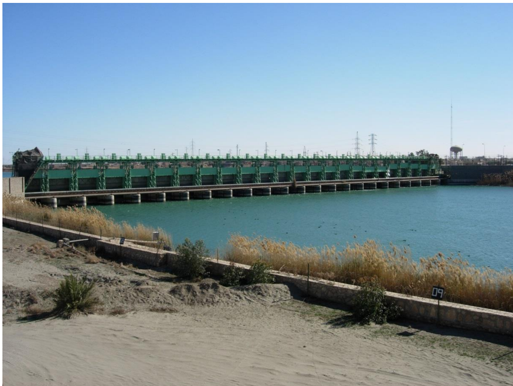
Figure 6: General view of Ramadi Barrage from the upstream side. [(Source:[5])].

Ramadi Barrage was air attacked in 1991, damage occurred. The rehabilitation was made by the staff of the Ministry of Irrigation. It also suffered damage due to the security circumstances in 2014 in Iraq. The cadres of the Ministry of Water Resources are currently undertaking rehabilitation works for the barrage.