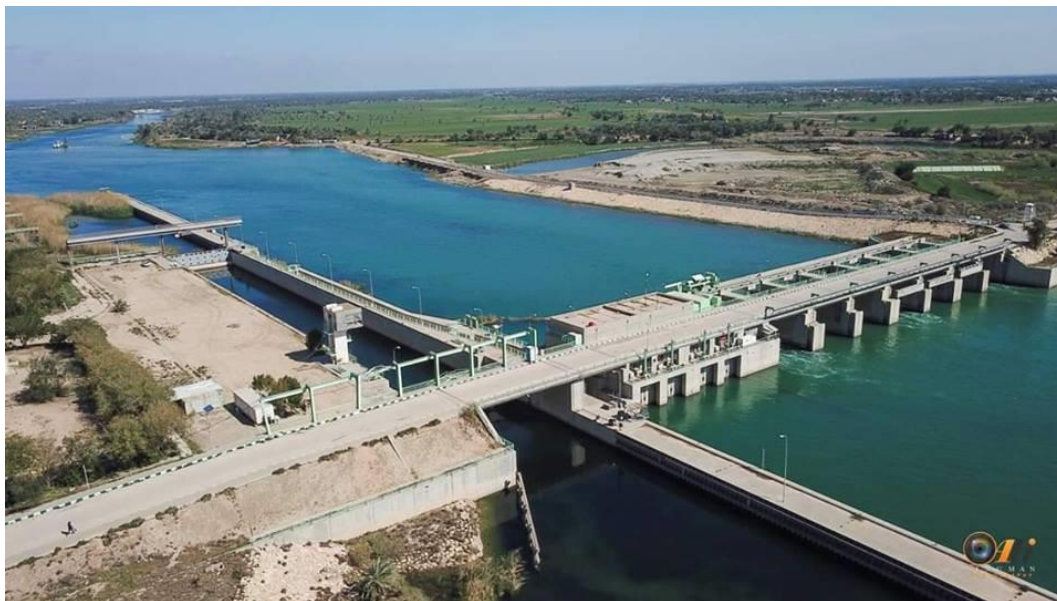
Figure 8: General view of Kufa Barrage. (Source:[5]).