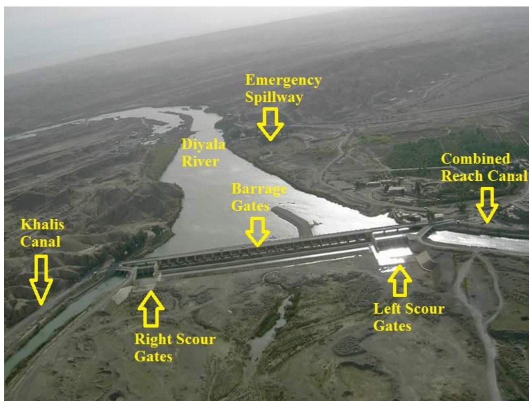
Figure 2: Aerial view of Diyala Barrage. (Edited by Author). (Source:[5]).

side with three gates and the left side with five gates. All of scour gates have dimensions of 2.5\text{m}\times 8\text{m} , the scour gates have maximum discharge of 700\text{m}^3/\text{s} . The emergency spillway was prepared on the left side upstream the barrage, in the case of exceptional high floods, the spillway have to lead water to Saladin flooding stream, which is connected to Shweicha depression. Diyala Barrage ensures water levels for two main head regulators, the dimensions of the openings of these regulators are 2.5\text{m}\times 8\text{m} , on the right, Khalis head regulator with 3 gates and maximum discharge of 75\text{m}^3/\text{s} , while on the left, there is Combined Reach head regulator with 4 gates and maximum discharge of 126\text{m}^3/\text{s} [2, 3, 6]. Figure 2 shows an aerial view of Diyala Barrage.