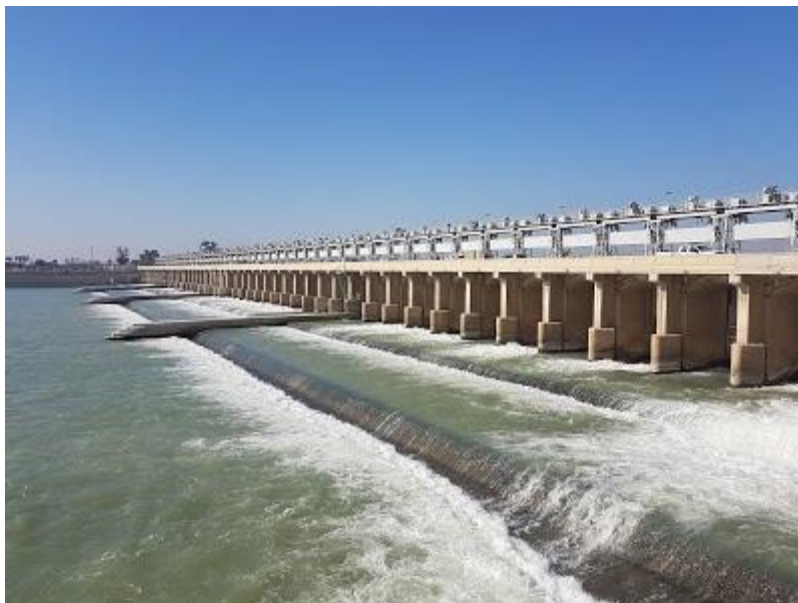
Figure 4: General view of Kut Barrage. (Source:[5]).