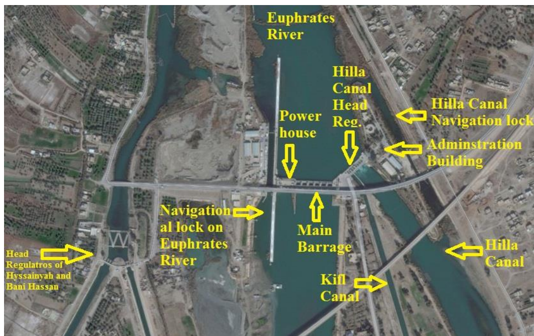
Figure 7: The details of Hindiyah Barrage. (Edited by Author).

within the river had been developed, where the project management building had built. To the left of the island, a 600-meter navigational channel linking Hilla Canal and Euphrates River and includes a navigational lock with dimensions 6m×90m.