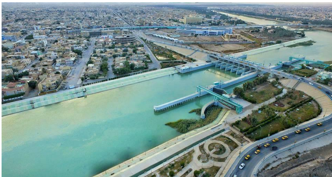
Figure 5: General view of Amarah Barrage. (Source:[5]).