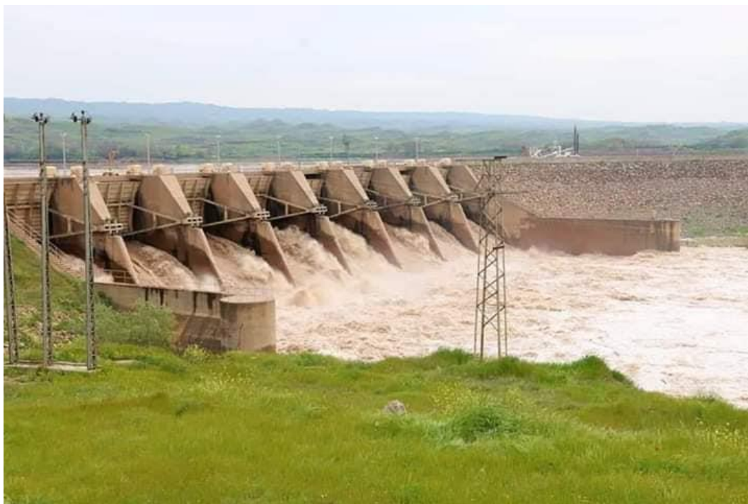
Figure 1: General view of Dibis Dam.

dam. A Chinese company between 1985 and 1987 had made the necessary repairs and the dam resume to operation [1, 2, 3, 4]. Figure 1 shows a general view of Dibis Dam.