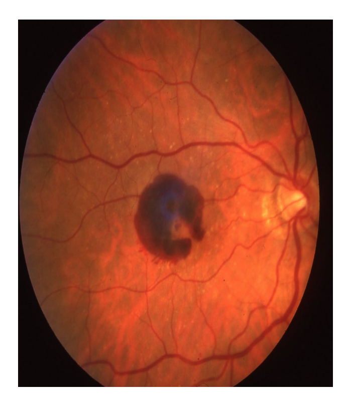
FIGURE 1: RETINAL FUNDOSCOPY OF WET AMD