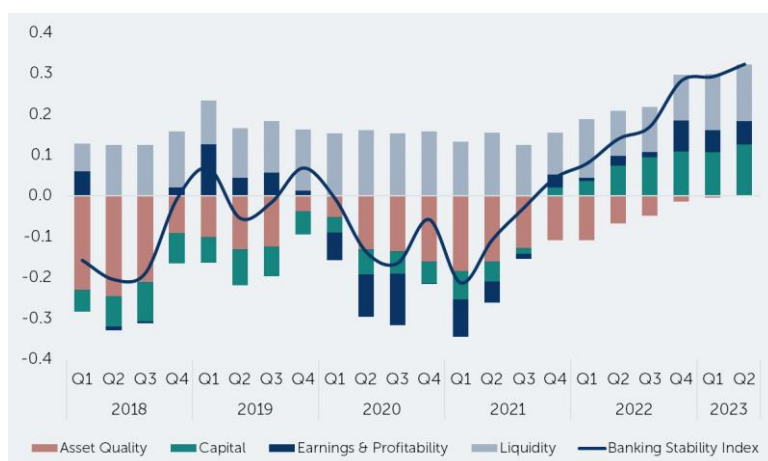
Figure 2. BSI and contributions of subindices.

The BSI averaged 0.01 between 2018 and the second quarter of 2023. Historical movements suggest that a BSI below zero is associated with an elevated risk of a local banking crisis, while a positive BSI corresponds with relative stability in the banking sector. The BSI was negative for the most of 2018 due to the impact of hurricanes Irma and Maria in 2017 in Sint Maarten (figure 2). In 2018, banks experienced an increase in non-performing loans and sharply increased specific provisions on loan losses, reflecting low asset quality, and causing a decline in earnings & profitability, and capital adequacy. At the end of 2018, the BSI was positively influenced by enhanced asset quality and earnings & profitability. Asset quality improved due to a substantial reversal of specific provisions on loan losses - which continued in 2019 - and a decline in non-performing loans. The reversal of the provisions on loan losses also favorably impacted earnings & profitability.