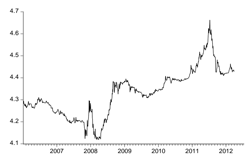
Figure 2: Kenyan FOREX rates (January 1, 2006 to July 13, 2012)