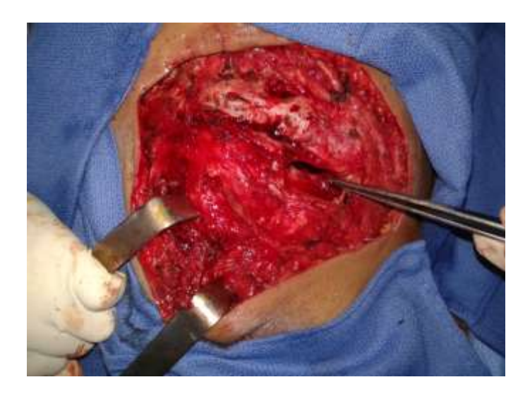
Figure 3: operative view showing the cavity of the hydatid bone abscess (patient in supine position, his head at the top)