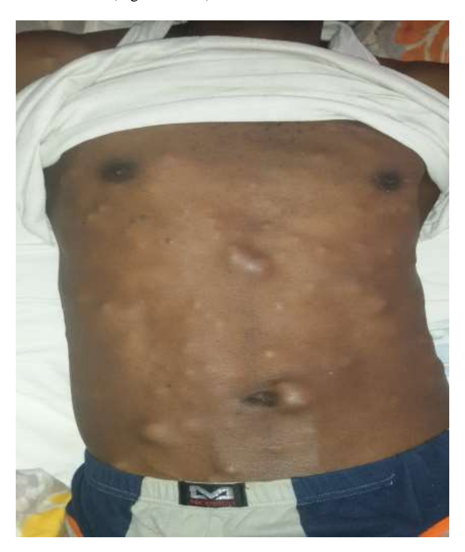
Figure 1: Cutaneous and Subcutaneous nodules on the anterior abdominal wall

He was admitted and commenced on haemodialysis to optimize him for a possible urinary diversion and chemotherapy. During this period one of the subcutaneous nodule was taken for histology which came out to be subcutaneous metastatic transitional carcinoma (Fig 3a and 3b).He however deteriorated and died.