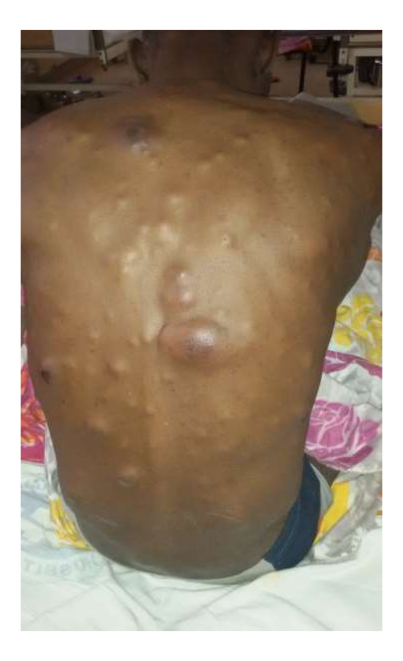
Figure 2: Cutaneous and Subcutaneous nodules on the posterior abdominal wall