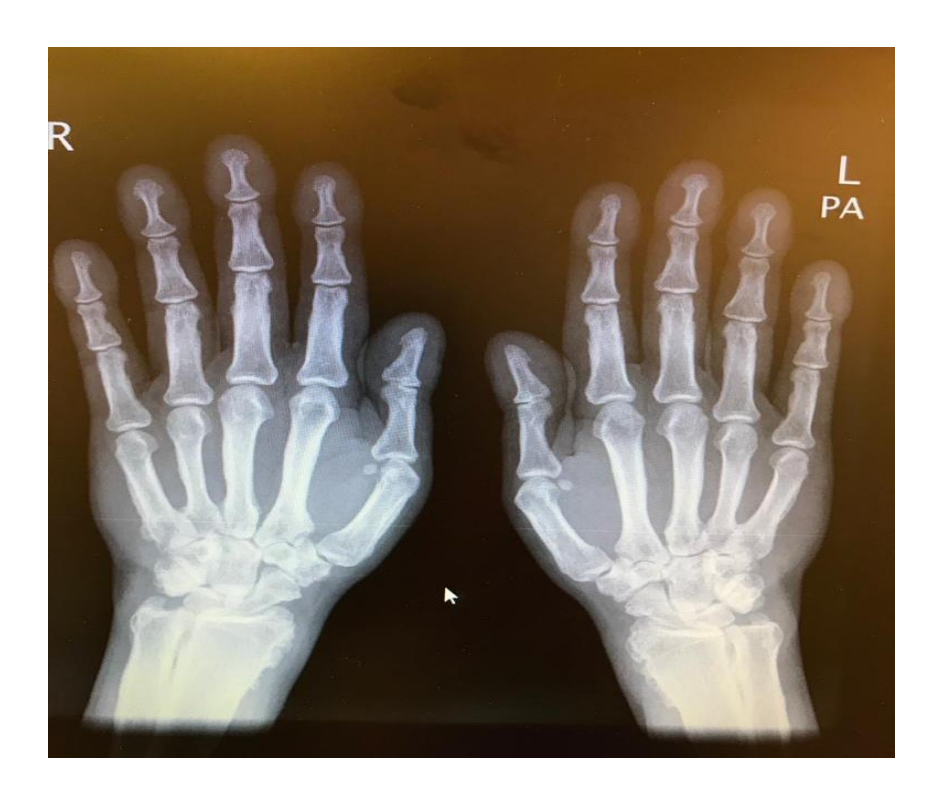
Figure 1: X-Ray of hands shows the subperiosteal new bone formation and bilateral clubbing of fingers

The X-ray image of the knee joints showed heterogeneous irregular periosteal calcification along the diaphyseal and metaphyseal regions of the tibia and femur.