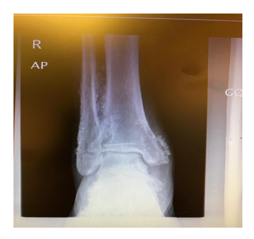
Figure 4: X-ray of the ankle joint showing heterogeneous irregular periosteal calcification seen along the diaphyseal and metaphyseal regions of the tibia and fibula.

The X-ray of the chest (PA view) showed clear lungs felids, normal hilar shadows, clear cardiophrenic, and costophrenic angles. No evidence of pleural effusion was observed. The Cardiac shadow had a normal limit and the Thoracic cage was unremarkable.