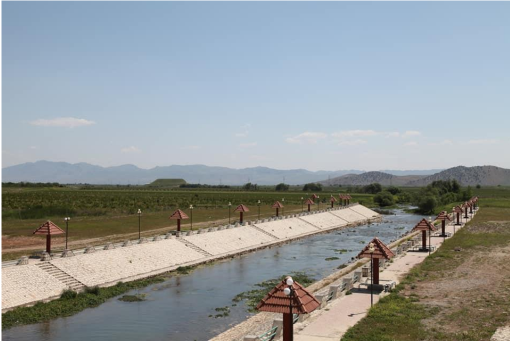
Figure 1: Main canal of Ranya Sarchawa irrigation project.

also a diversion conduit of 5mx8m dimension and 2 head regulators with discharge of 2.4\text{m}^3/\text{s} . Concrete-lined Canals have carried out, 4 canals of total lengths 13km. Figure 1 shows the main canal of Ranya Sarchawa project.