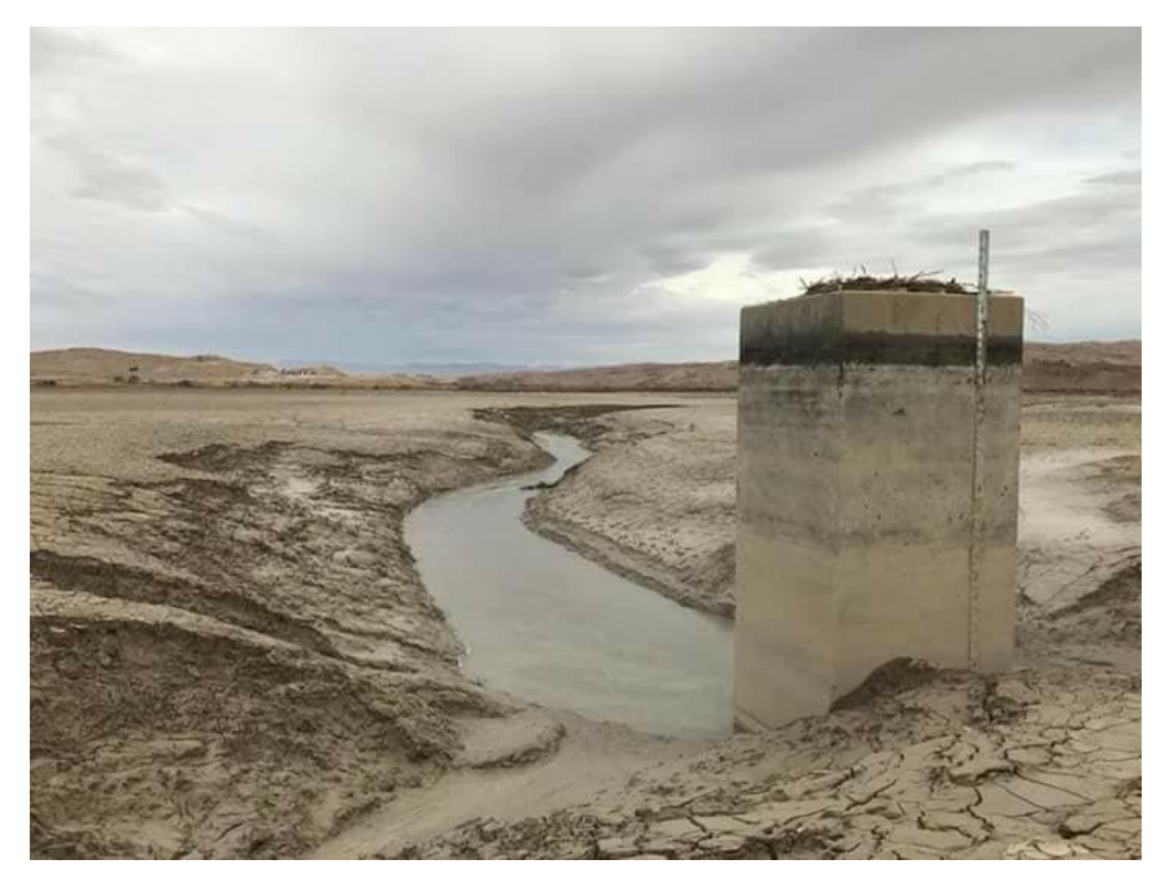
Figure 2: General view of Mandaly Dam Reservoir filled with sediments. (Source:[7]).