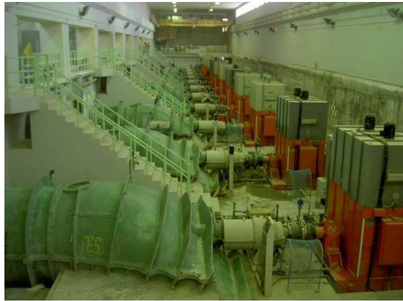
Figure 2: General view of MOD pumping station from the inside. (Source:[2]).