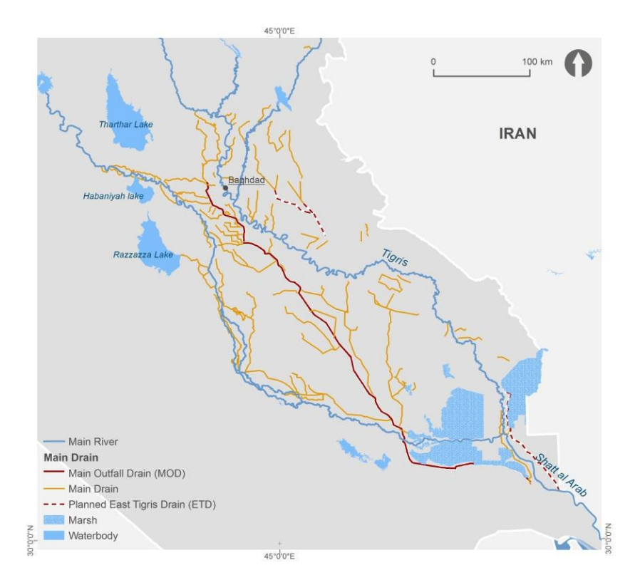
Figure 1: Route of MOD..