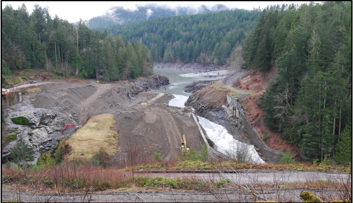
Figure 10: View of Elwha Dam after removal.