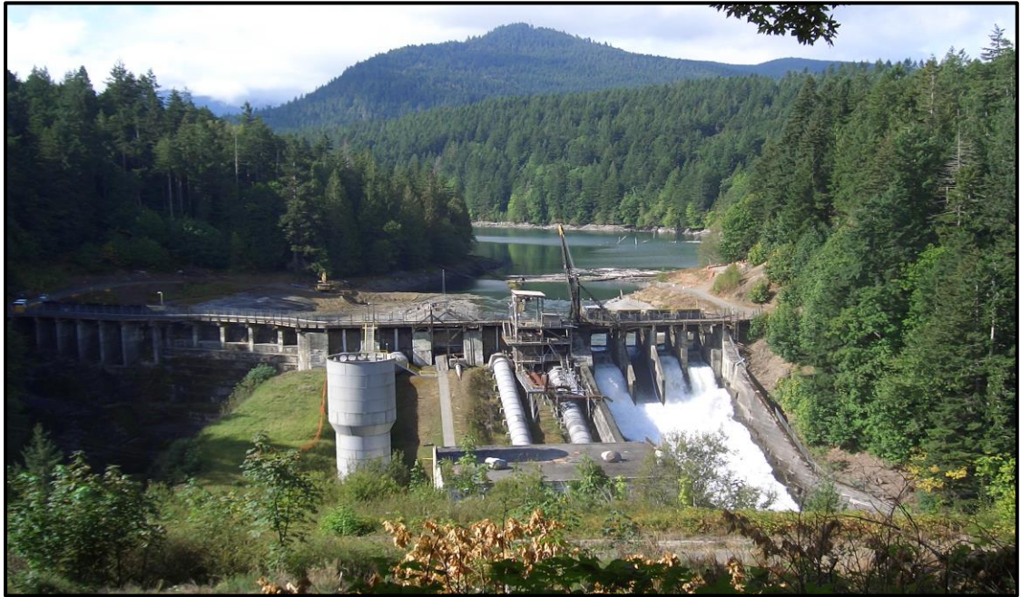
Figure 9: View of Elwaha Dam before removal.

Glines Canyon Dams were removed in 2012. The total cost of purchasing and removing the dams and hydropower facilities, and conducting river restoration activities was $324.7 million. Costs and benefits of the restoration of the project are given in Table 2 shown already. Photos showing the Elwaha Dam before and after removal are presented in Figures 9 and 10. The stages of removal operation can also be viewed in an interesting video film posted on the following link; https://youtu.be/m96VcCF4Ess