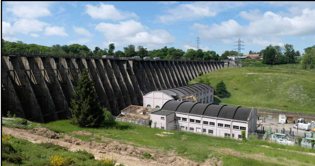
Figure 3: Vezins dam before removal [23].

The removal of both dams was part of an ambitious program, unprecedented in Europe, to restore ecological continuity between the terrestrial and marine habitats connected by river basins [25].