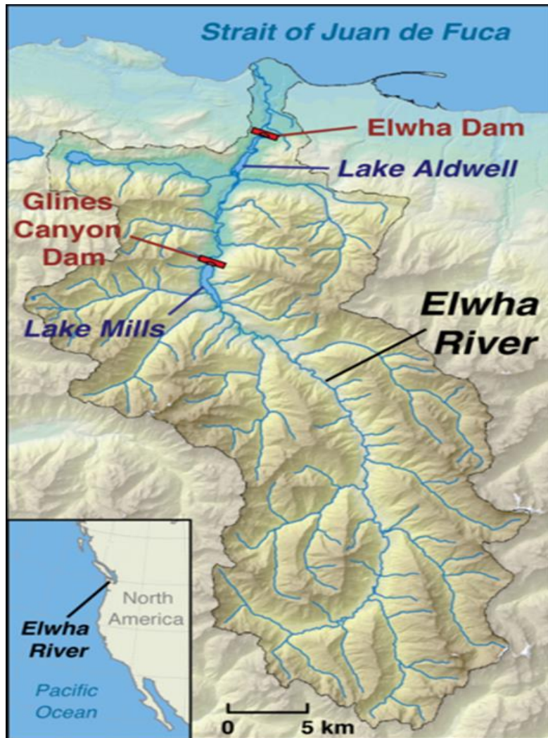
Figure 8: Location of Elwha and Glines canyon dams on Elwha River [30].

An act of the Congress in 1992 revoked renewal license of the dams which was issued by FERC and called for restoration of the river. This act stipulated the following: