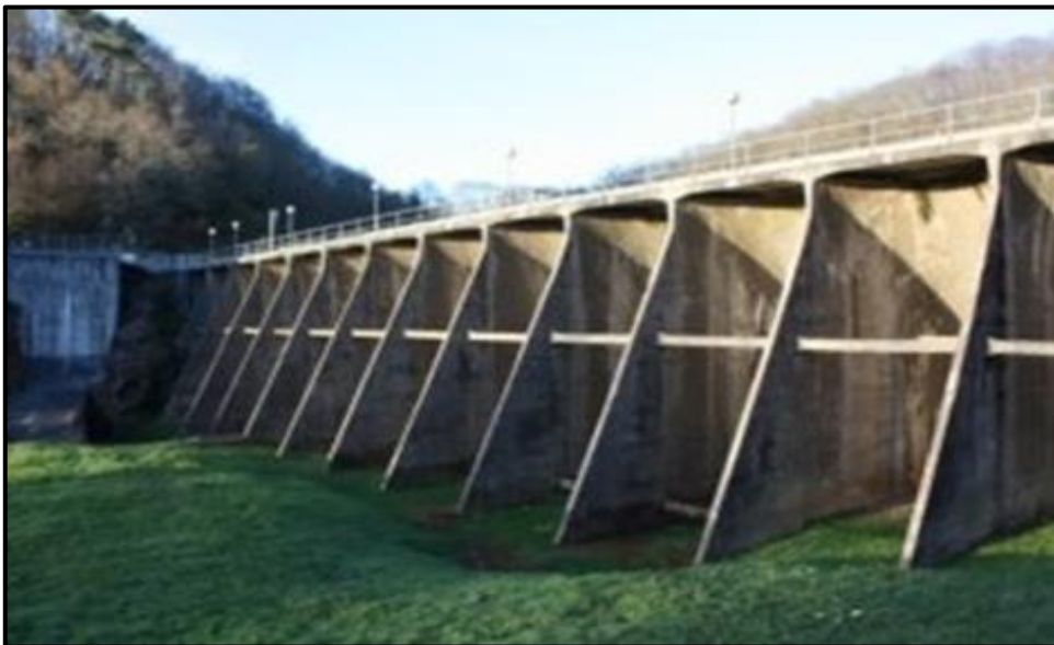
Figure 4: La Roche Qui Boit before removal [23].