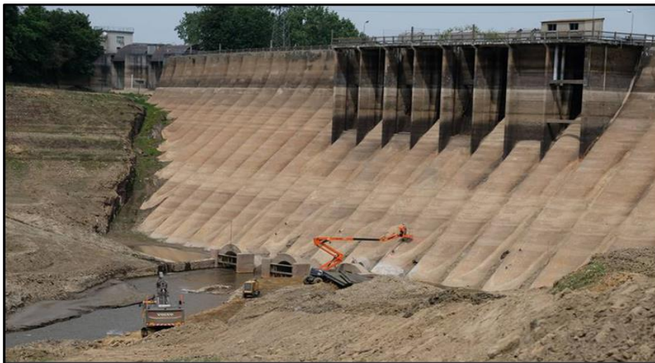
Figure 6: Vezins dam at an early stage of demolition [24].

Other dam removal cases are also mentioned in the literature. Such cases are the case of Saint-Etienne du Vigan Dam (built in 1895, dismantled in 1998) and the Poutès Dam built in 1941. Both dams were located on The Allier River, main tributary of the river Loire in France [26].