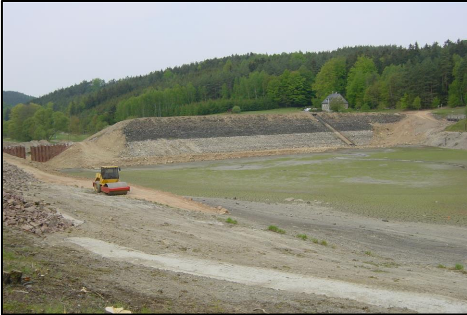
Figure 7: Dam removal in progress in 2007.

The actual removal process was fully described with lessons learned after eleven years in the International Seminar on Dams Removals that was held by Karlstad University (KAU) in Sweden on 24-26 September 2018 [29].