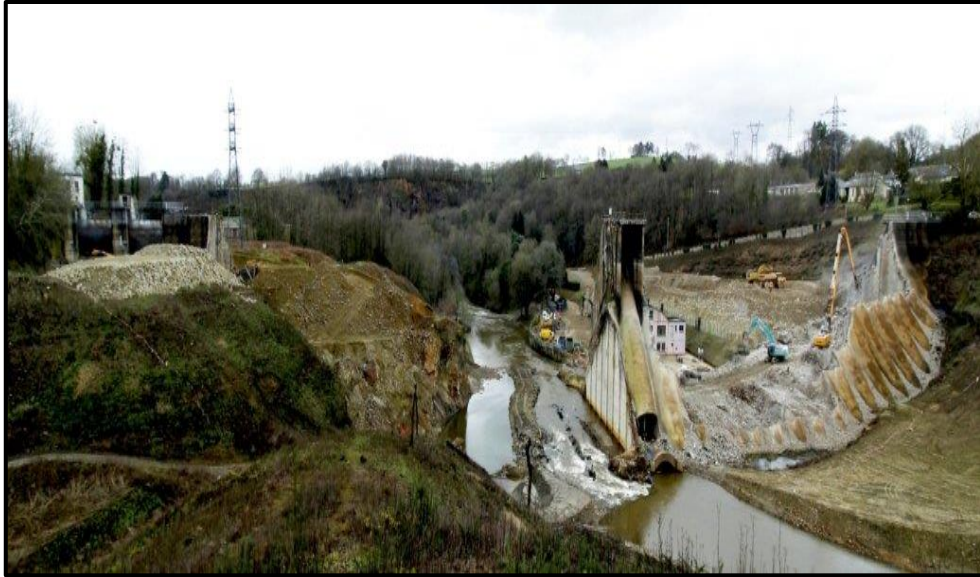
Figure 5: Vezins dam at an advanced stage of demolition [23].