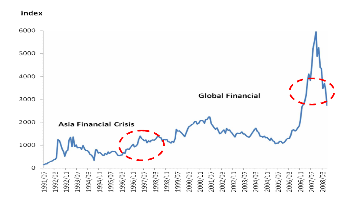
Figure 2: Shanghai stock exchange composite index from Jul. 1991 to Aug. 2008

Thus, the appreciation periods of the Taiwan TAIEX index are defined as