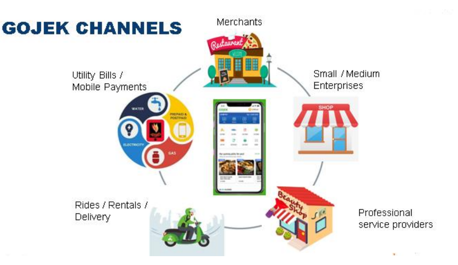
Figure 3: GO-JEK current channels